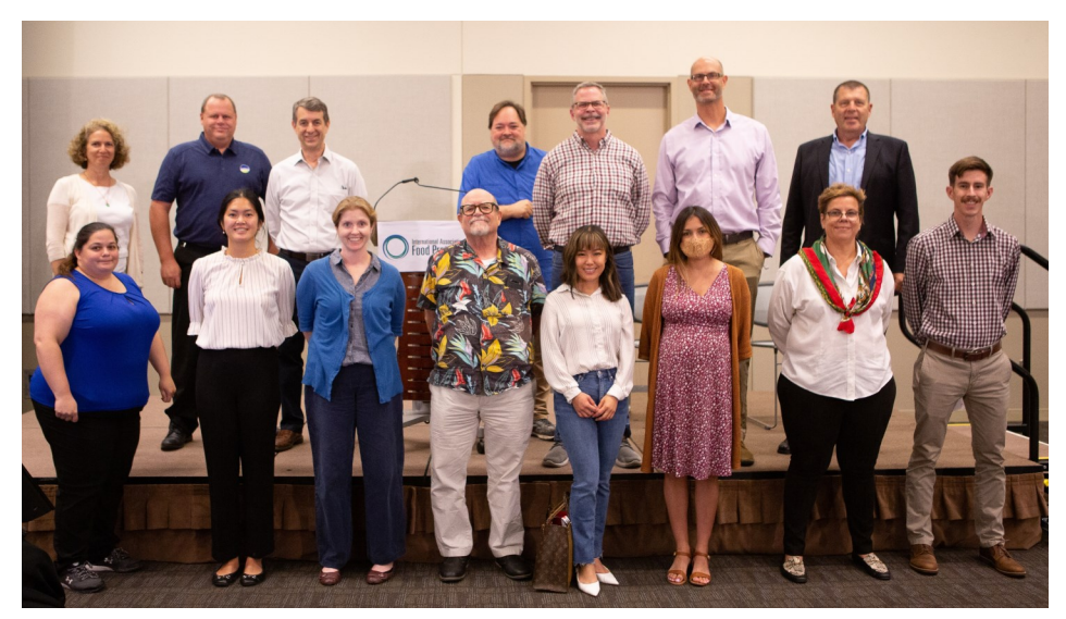
The California Association for Food Protection held its introductory meeting on July 19 in Phoenix, Arizona during IAFP 2021.